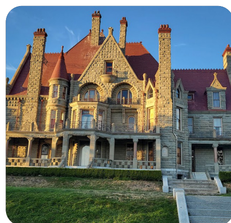
Craigdarroch Castle, Victoria