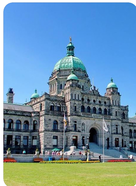
Victoria - Capital of BC