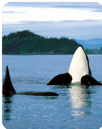
Whale Watching