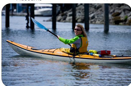
Year-Round Outdoor Activities (Nanaimo)