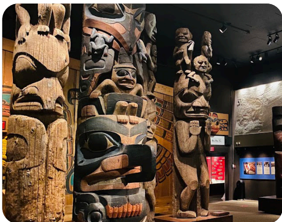
Aboriginal Heritage - Royal BC Museum