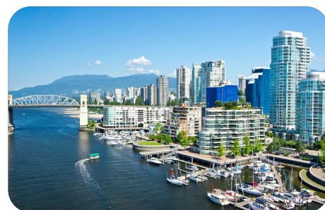
Vancouver - ferry across Strait of Georgia