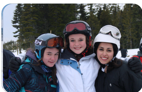
Amazing Skiing-Snowboarding (Mount Washington)