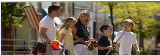
FRIENDLY & FAMILY-ORIENTED COMMUNITY