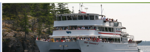
CHIEF COMMANDA: SCENIC CRUISES ON LAKE NIPISSING